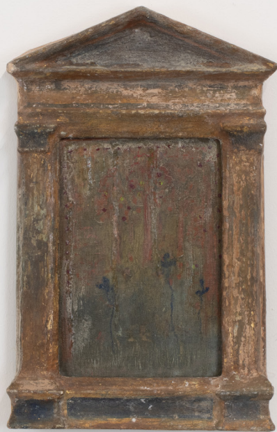
Apple orchard , 2023, Oil and charcoal on canvas, with PLA printed frame, 35 x 25 cm