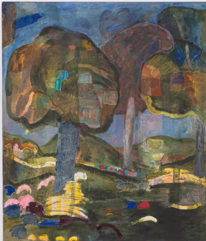
Late morning in Essex, 2025, Oil on canvas, 70.5 x 60 cm