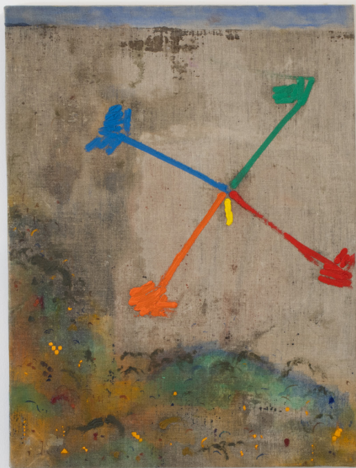
Intense stillness , 2024, Oil on canvas, 61 x 46 cm