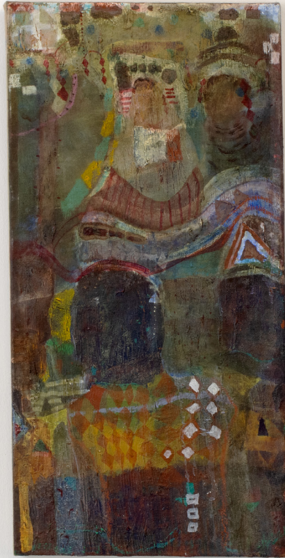
Zabadaks , 2024, Oil on canvas, 60 x 30 cm