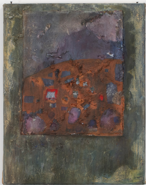
Round Table , 2022, Oil on canvas, 45 x 35 cm