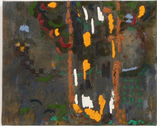
Counting Sheep , 2025, Oil on canvas, 44.5 x 35.5 cm