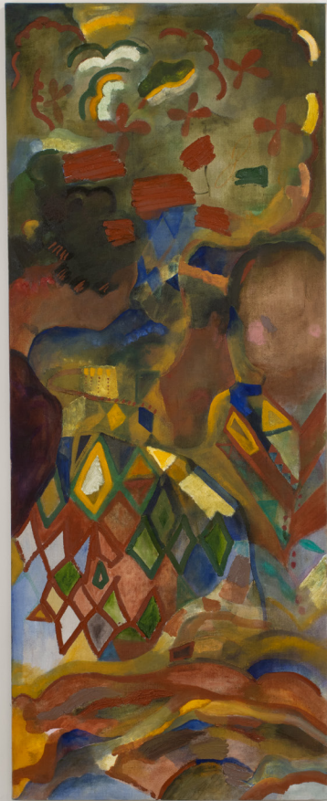
Parenthood , 2023, Oil on canvas, 150 x 60 cm