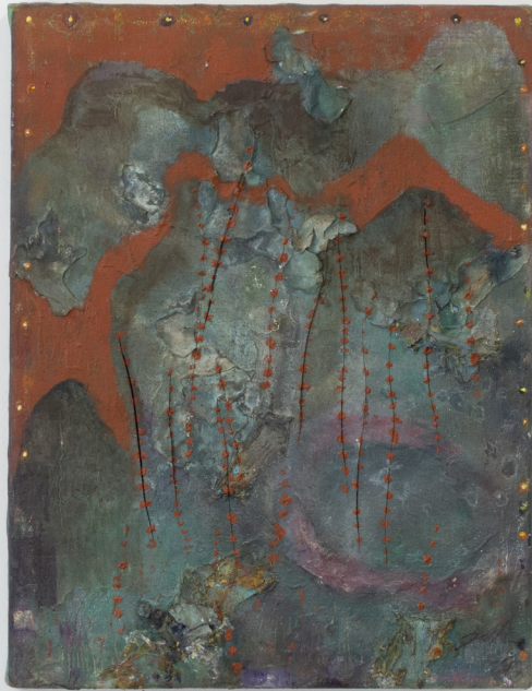
Tang Hu Lu , 2022, Oil on canvas, 45 x 34 cm