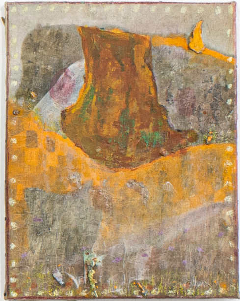
Shy Poets , 2023, Oil on paper mounted on canvas, 45 x 35 cm