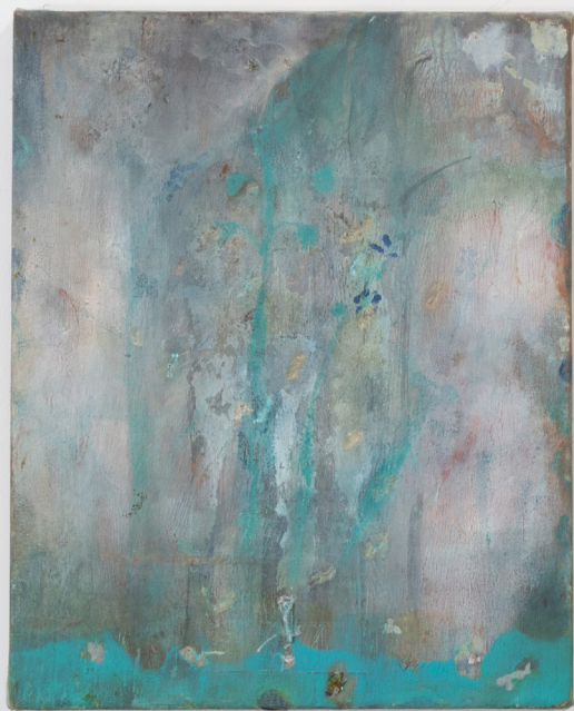
画儿花, 2022, Oil on canvas, 45 x 35 cm