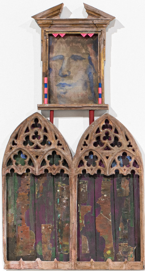
Queen , 2025, Oil on canvas with gilded 3D printed frame, 93 x 50 cm