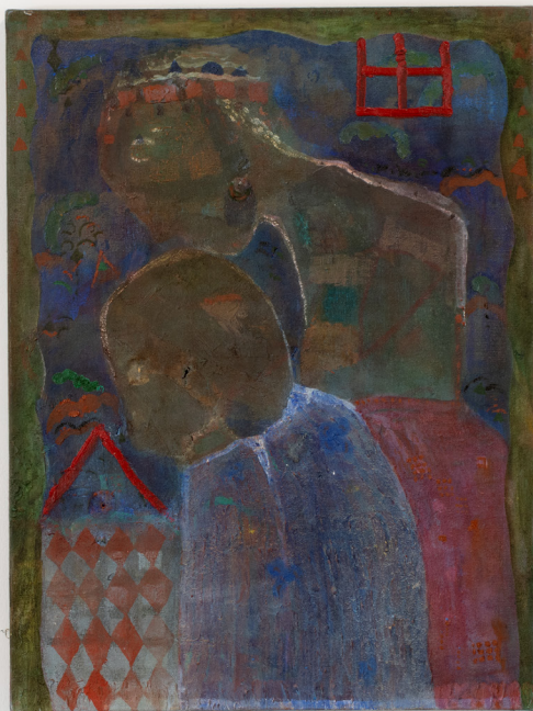
Filial Piety , 2025, Oil on canvas, 61 x 46 cm