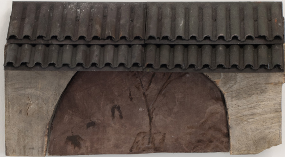
Si He Yuan , 2025, Oil on wood panel with 3D printed frame, 32 x 17 cm