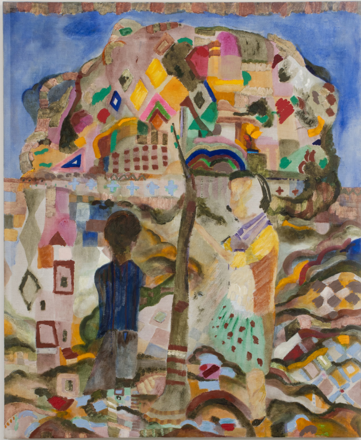
Meadow , 2024, Oil on canvas, 120 x 100 cm