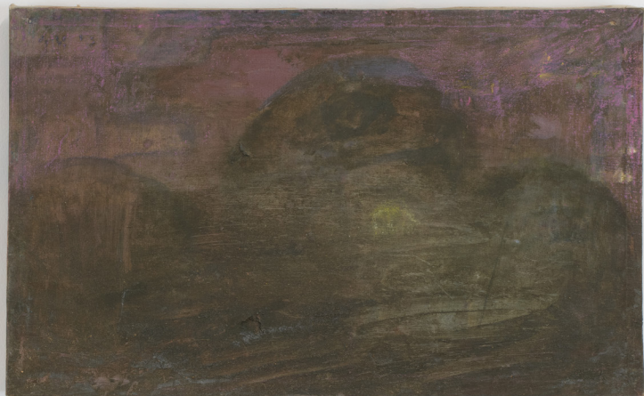
Via Aurelia, and her men , 2023, Oil on canvas, 28 x 40 cm