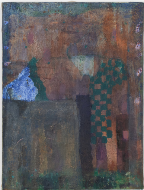
Thieves on Mars , 2023, Oil on paper mounted on canvas, 44.5 x 33.5 cm