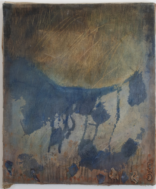
Crossing the yellow river 面对黄河，我惭愧, 2023, Oil, latex and graphite on canvas, 35 x 30 cm