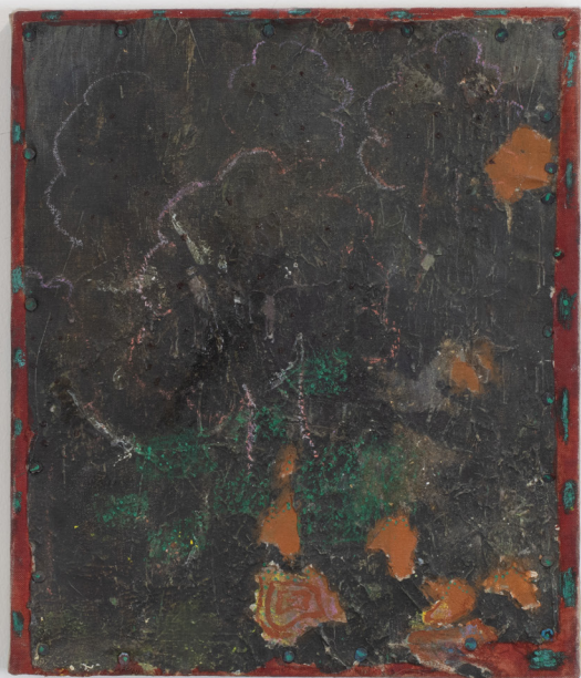
Chalkboard , 2024, Oil on canvas, 31 x 26.5 cm