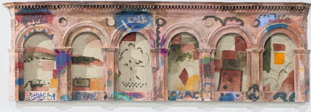
Bologna, 2024, Oil on canvas with gilded 3D printed frame, 149 x 57 cm