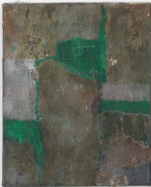
Birthday body , 2022, Oil on canvas, 45 x 35 cm