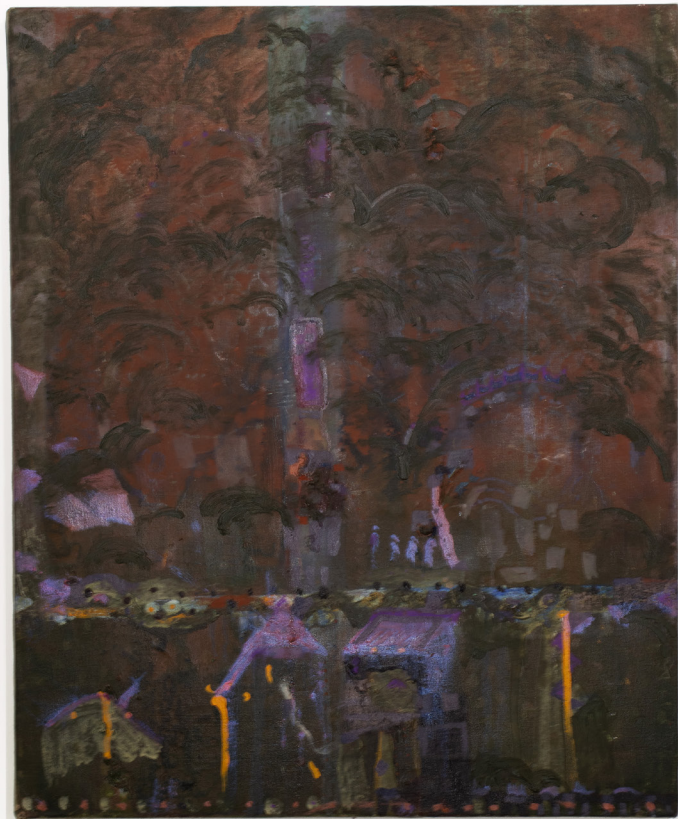
Screen , 2025, Oil on canvas, 78.5 x 60 cm