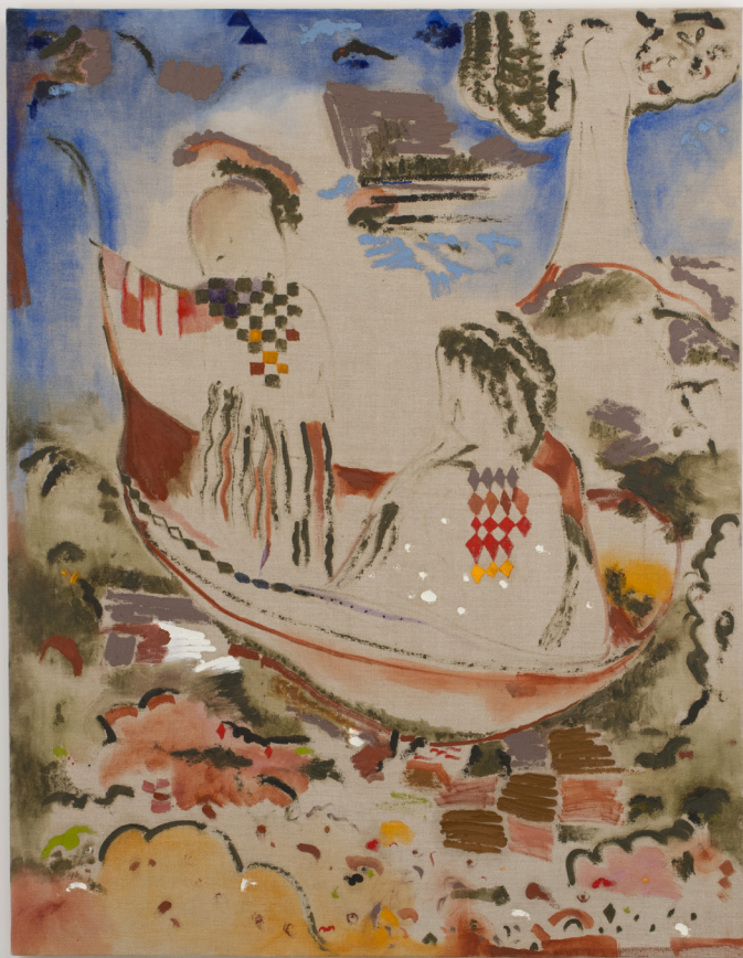
Young sailors , 2024, Oil on canvas, 121.5 x 91 cm