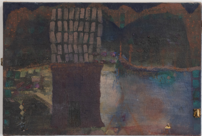
Guru Hall 祖师殿, 2024, Oil on canvas, 21 x 35 cm