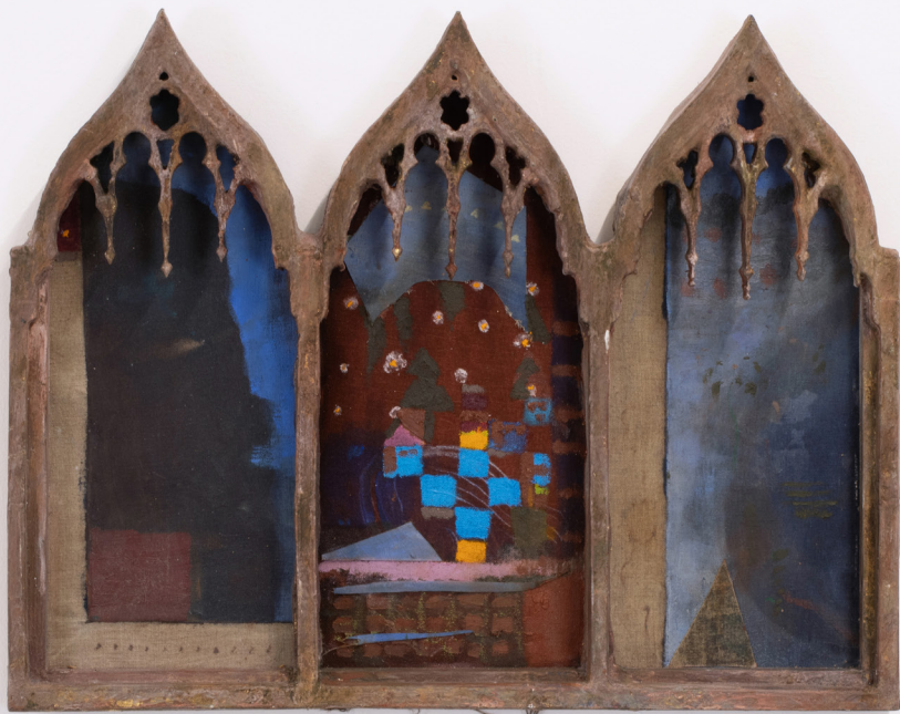
House of the Black Heads , 2024, Oil on Canvas with 3D Printed Frame, 45 x 50 cm