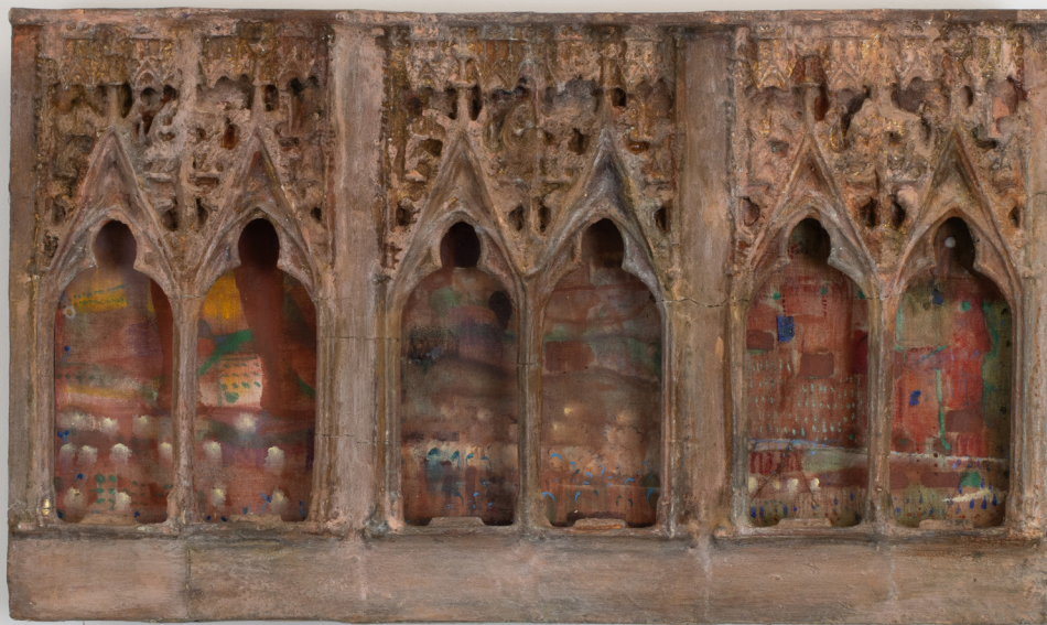
Farm , 2023, Oil on canvas with 3D printed frame, 76.5 x 46 cm