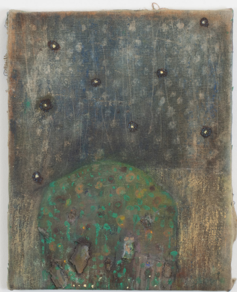
Grandma's dress , 2023, Oil on canvas, 34.5 x 26.5 cm