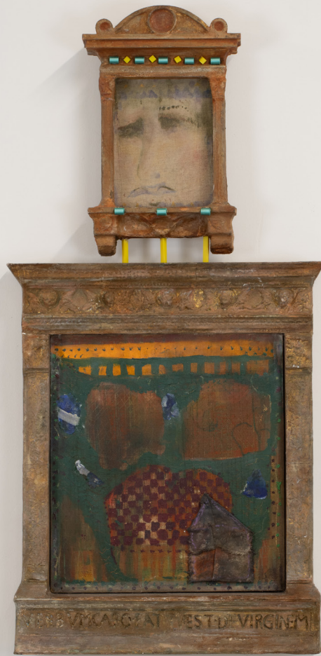
King, 2023, Oil on canvas with gilded 3D printed frame, 100 x 60 cm