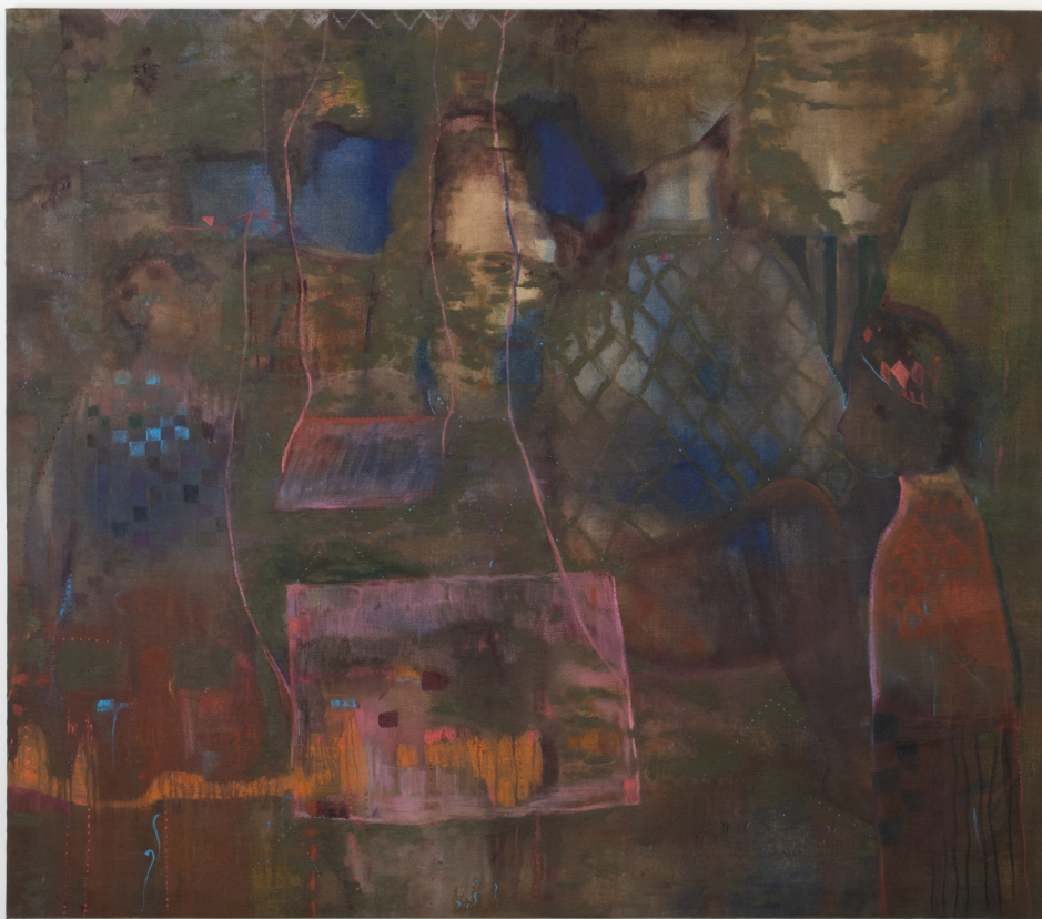
Letters from Tonino , 2023, Oil on canvas, 159.5 x 139 cm