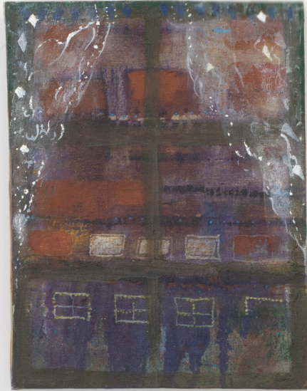
Outside the window , 2024, Oil on canvas, 43 x 32 cm