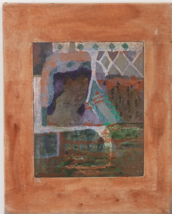
Princess , 2024, Oil on canvas, 60 x 52 cm