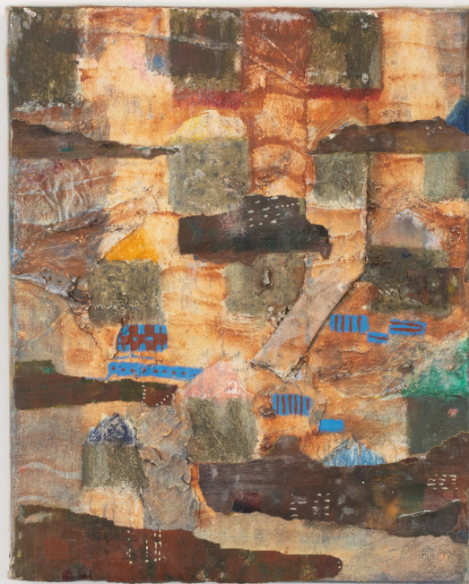
Village , 2024, Oil on canvas, 45 x 35.5 cm