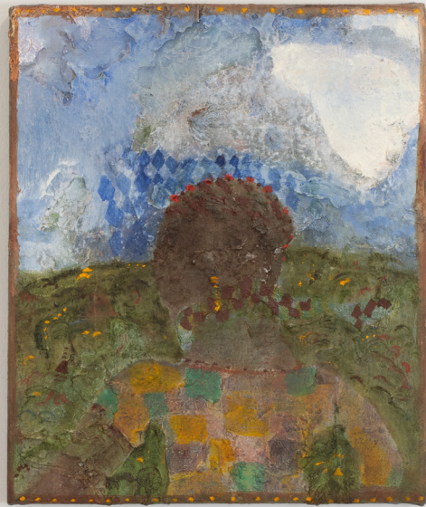
Cloudwatcher , 2024, Oil on canvas, 29.5 x 25 cm