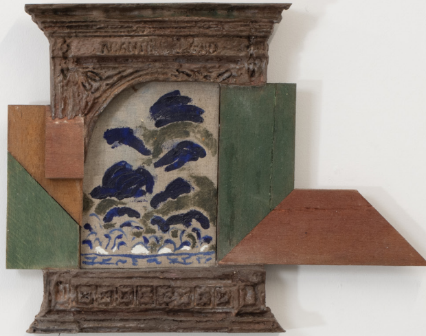
Bry , 2024, Oil on canvas, with PLA printed frame and timber, 34 x 44.5 cm